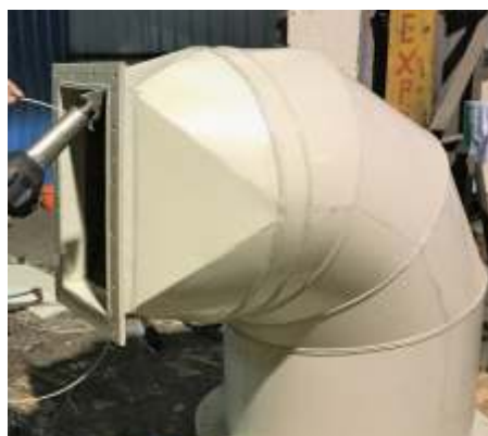
Customize Elbow Fabrication