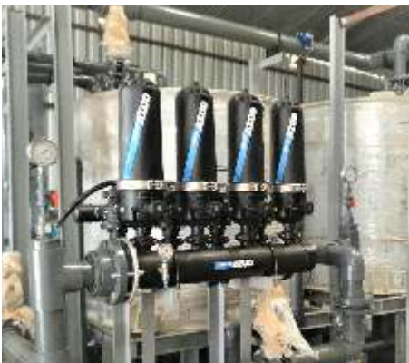
Chemical Filtration Skid