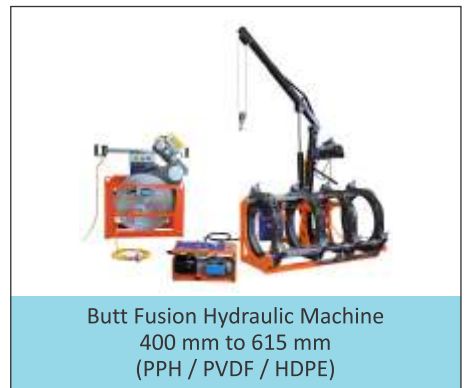
Butt Fusion Hydraulic Machine 400 mm to 615 mm (PPH / PVDF / HDPE)