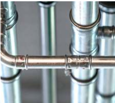
SS Metal Piping Press Technology