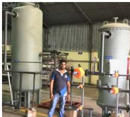
Water Treatment Skid