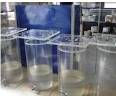
Acrylic, Polycarbonate & Transparent PVC Tanks & Flask