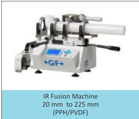
IR Fusion Machine 20 mm to 225 mm (PPH/PVDF)