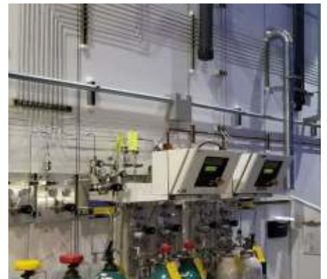
Semi-Conductor Fab Piping