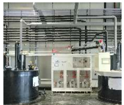
Hazardous Chemical Distribution Piping