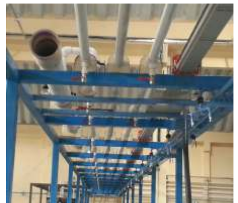
Metal Compressed Air Piping