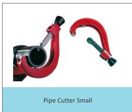
Pipe Cutter Small