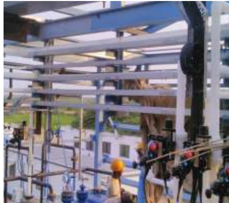
Bromine Transfer Piping