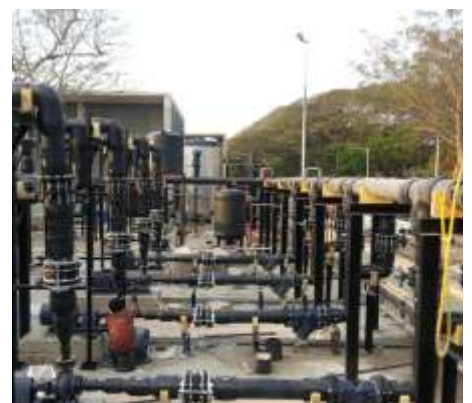
Chilled Water Piping System