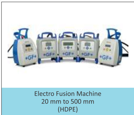
Electro Fusion Machine 20 mm to 500 mm (HDPE)