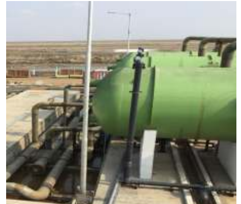
Water Treatment Piping