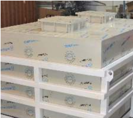
PP / PPH Tanks