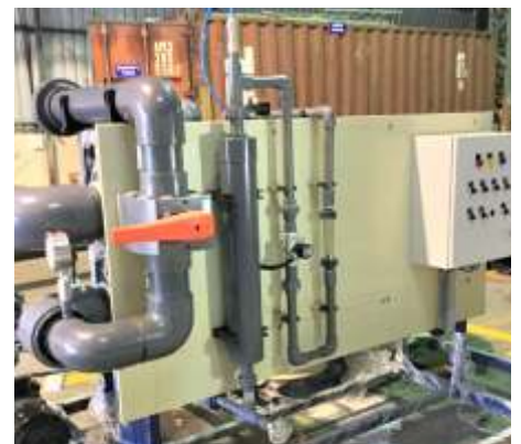
Effluent Treatment Plant Skid