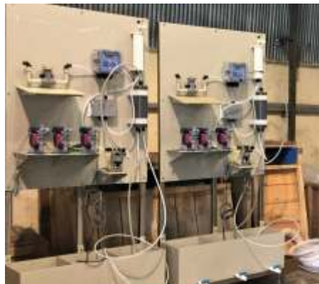
Automation Piping Skid