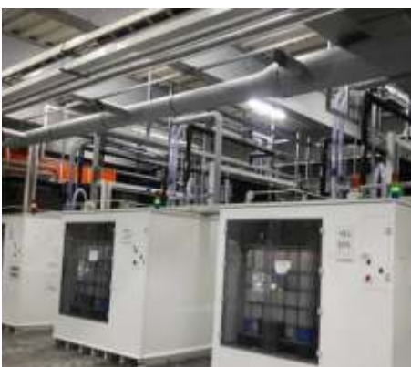
Chemical Distribution Piping