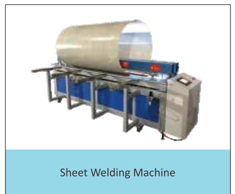
Sheet Welding Machine