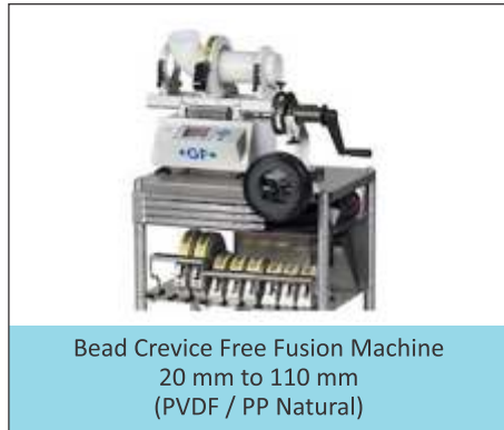
Bead Crevice Free Fusion Machine 20 mm to 110 mm (PVDF / PP Natural)