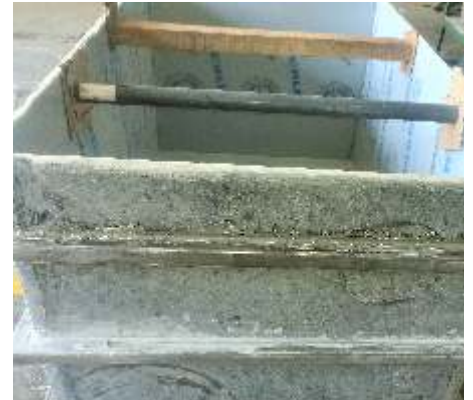
PVDF FRP Tanks