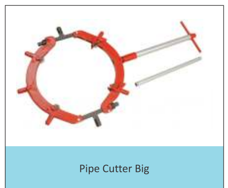
Pipe Cutter Big

We follow the DVS standard at every stage of our fabrication.