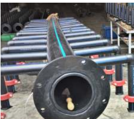
Plastic Piping Fabrication