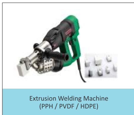
Extrusion Welding Machine (PPH / PVDF / HDPE)