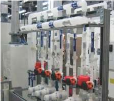
PVDF/PPH High Purity Piping