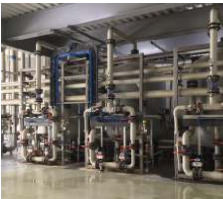
Effluent Treatment Piping