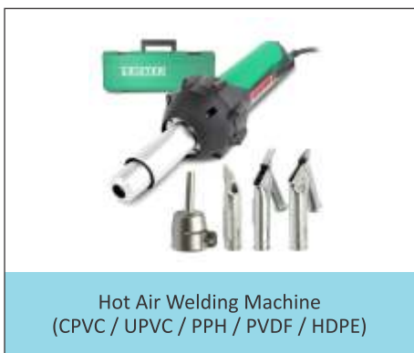
Hot Air Welding Machine (CPVC / UPVC / PPH / PVDF / HDPE)